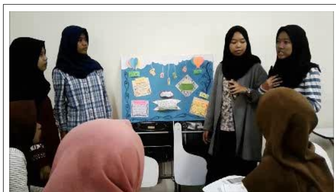
FIGURE 2 | Students' presentation through poster

The observation was done through a 45-minute video recording to generate how their self-directed learning during conducting poster presentation emerged. This recording described the participants who were conducting the materials through poster presentation to three groups of visitors. They had to present their materials related to the subject of spoken grammar as long as fifteen minutes to each visitor. The stages of learning process through poster presentation is explained in Table 1 .