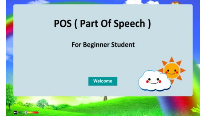
FIGURE 1 | Cover of Application

After being revised, the final product developed can be described as follow: