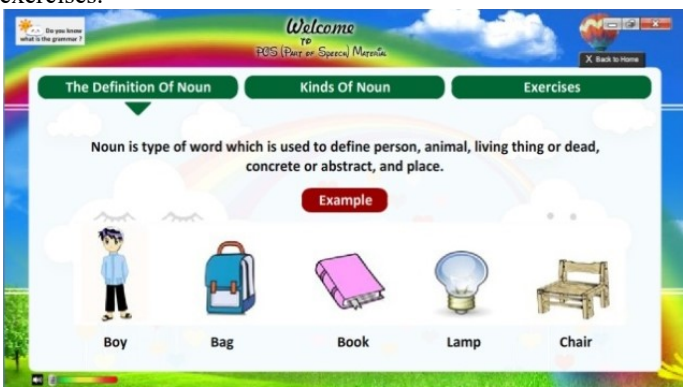
FIGURE 3 | The Definition of Part of Speech

After click welcome, the user will see kinds of part of speech. Before giving exercises, the researcher also gave material related part of speech. In this application there were eight parts of speech. Those were noun, verb, adjective, adverb, pronoun, preposition, conjunction, and interjection. When the user clicked one of part of speeches, there were three categories that involved in this slide. Those were the definition of part of speech, kinds of part of speech, and the exercises.