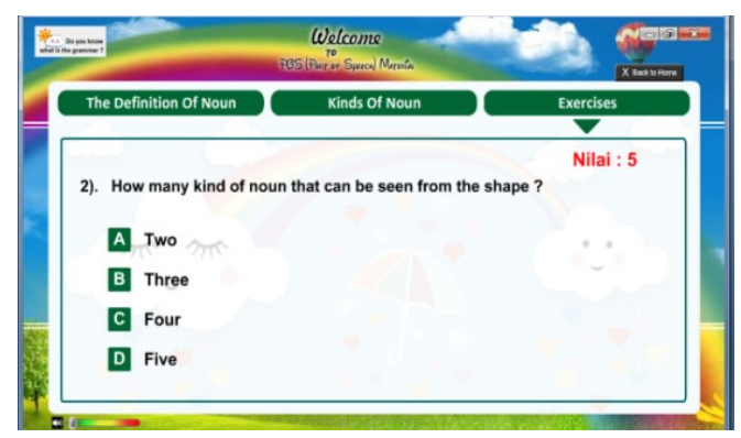
FIGURE 5 | Multiple Choice Exercises

In this slide, the researcher explained more about kinds of part speech and the example. Different topic will have different the number of variety of part of speech.