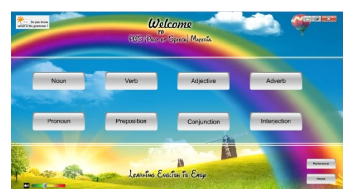
FIGURE 2 | Kinds of Part of Speech

On the cover, the researcher only displayed POS (Part of Speech) for beginner students. The reason why the researcher used the term beginner since this application also could be used by another beginner learners who needed it. However the definition beginner in this study is students of sixth grade. When the user wants to start to learn, they can click the welcome button.