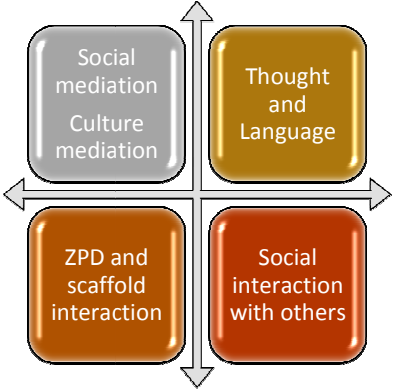
Figure 1.1. Components of socio-cultural theory

Socio-cultural theory plays an integral role in cognitive development of a child Kozulin (2002). It directly focuses on social interaction specifically adults (Ellis & He, 1999). VT highlights the integration in a dynamic way.