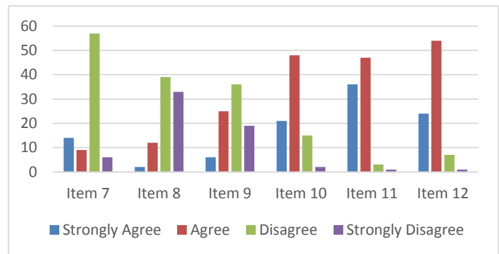
FIGURE 2 | Undergraduate Students' Emotional Reaction towards Oral Constructive Criticism

When the students were asked about their feelings after receiving constructive criticism from their faculty members, they gave varied and complex emotional responses. The result of the online survey related to the students' emotional reaction towards the use of oral constructive criticism in the classroom is drawn in Figure 2 .