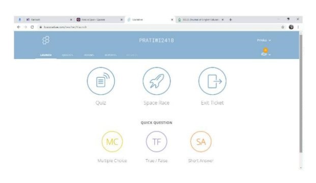
Figure 2 Socrative Application Display

Socrative website, save it on Google drive, or email it. If teachers wanted to use this as homework, they could not check the students' time to do the test as teachers had to online during the students were doing the test.